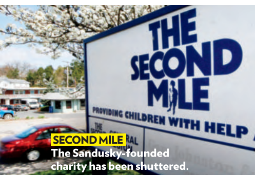
SECOND MILE The Sandusky-founded charity has been shuttered.